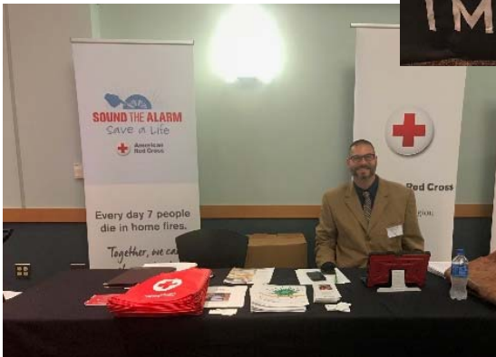
American Red Cross