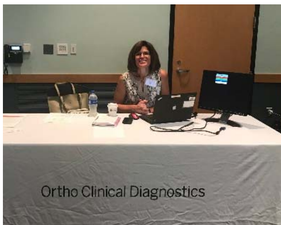
Ortho Clinical Diagnostics