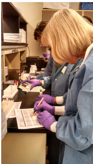
Participants hard at work performing rule outs for multiple antibody sample using Immucor solid phase testing