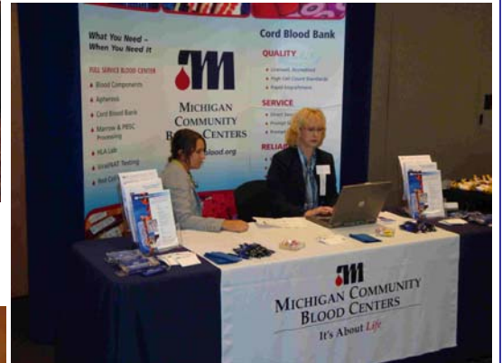
Michigan Community Blood Center