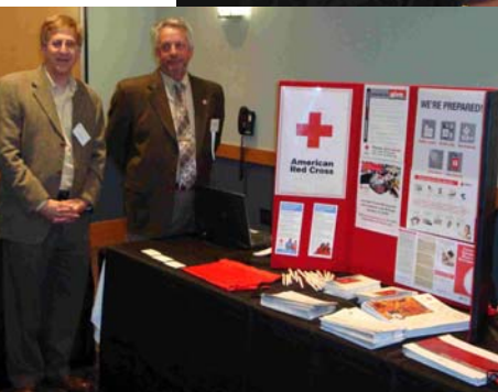
American Red Cross S.E. MI