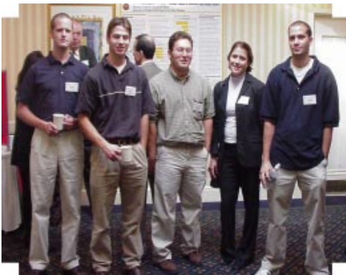
Med Tech students from DMC Laboratories